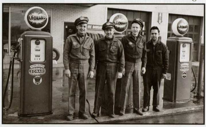
In the 1950s consumers expected a uniformed attendant to be waiting at the pump who would take care of filling the gas tank and service the car.