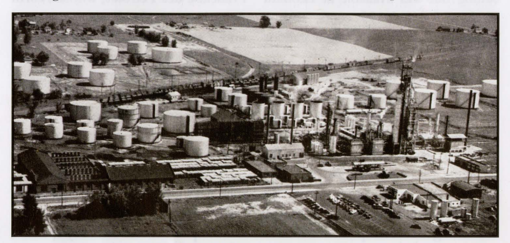
The Leonard Refinery Field in 1951.